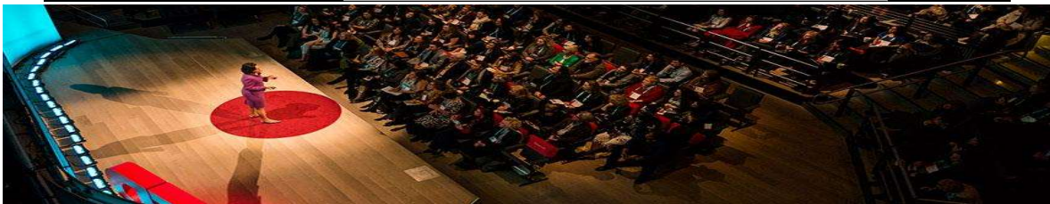
At AEMPIN workshops where Women in Business and Entrepreneurship, industry representatives and business leaders connect, grow, thrive and empower. Engage in professional development specific to your business field, advance your business and earn professional development hours and CEUs.